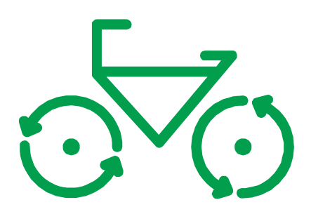
Cascade Bicycle club http://www.cascade.org/