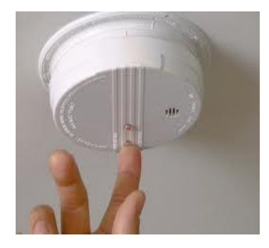
Remember to set your clocks back one hour on Sunday, November 3.

Set Clocks Back Nov. 3 – Recycle Batteries & CFLs