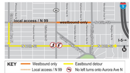
Current eastbound detour route